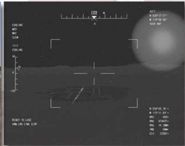
MQ-1 Predator Sensor Operator HUD